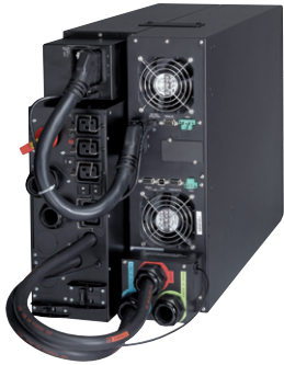
9PX 11kVA with Maintenance ByPass